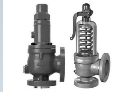
Units and spare parts for drilling pumps